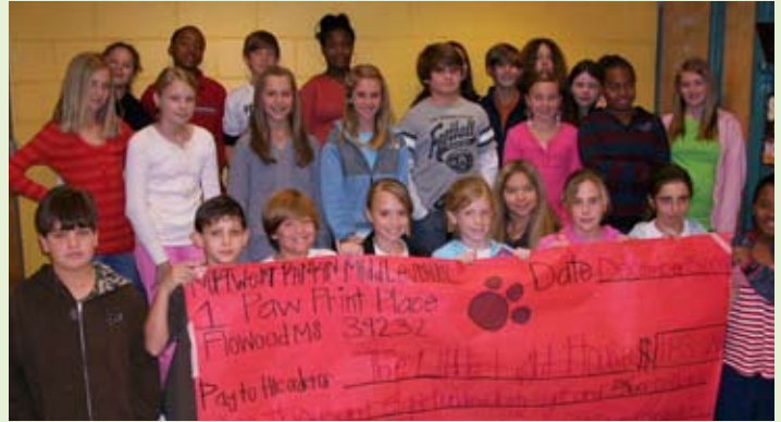
Students from Northwest Rankin Middle School present a big check.