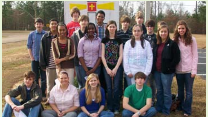
Brandon High students visit LLH after their successful fundraiser.